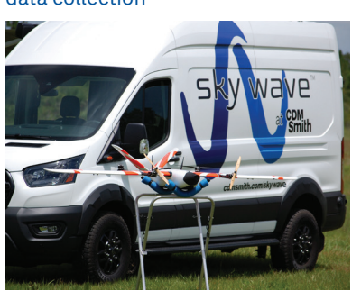
American-made and federally compliant