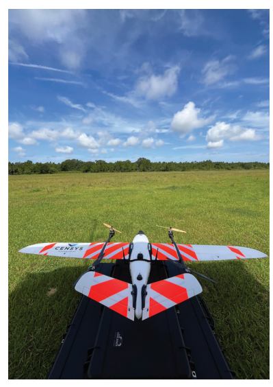
Reduce or Eliminate Costly Field Labor

Less time planning and mobilizing and more time flying and collecting data. Help drive data to decisions through Sky Wave at CDM Smith.