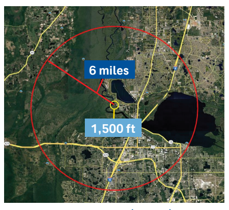
CDM Smith drone range (6 miles) vs typical drone (1,500 ft)