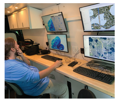
Mobile Command Center enhances data collection

The digital pipeline is a powerful tool to take data from the field through processing to help drive data to decisions. We have the experience and expertise in collecting large digital datasets and harnessing automation and AI to gain actionable intelligence and develop project solutions.